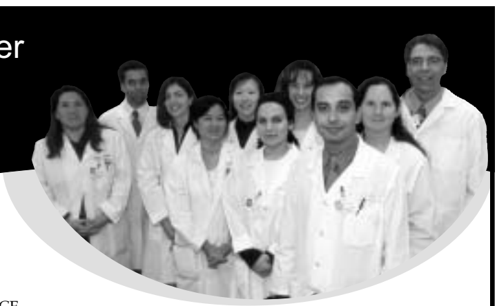
Medical Staff of the Redwood Shores Health Center

Located in the Marketplace across from Nob Hill 290 Redwood Shores Parkway, Redwood City