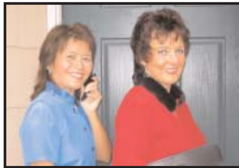
"THE DYNAMIC DUO"

731 Marcie Circle, South San Francisco Two bedroom, one bath, end unit top floor with city views from every room. Vaulted ceilings in living room. Absolutely move-in condition. Loft 2nd bedroom is currently used as an office. Wood burning fireplace in living room. Great value for first time buyer. Easy access to freeways and shopping. Priced at $342,800.