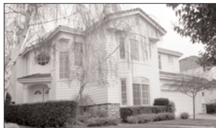
998 Governors Bay, RWS

Gossamer Cove's water front beauty 5 yrs old, 2360 sq ft 4br/2.5ba/2car