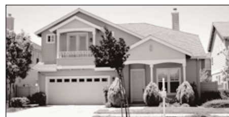
2016 Gossamer Ave., RWS

JUST SOLD! $1,385,000 4 Br+ den/ 3ba/2car Large 9206 sf lot. 2575sf home. Boat dock.