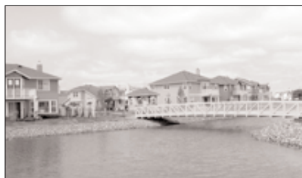
2009 Rockport Ave, RWS

Gossamer Cove's water front beauty 5 yrs old, 2360 sq ft 4br/2.5ba/2car