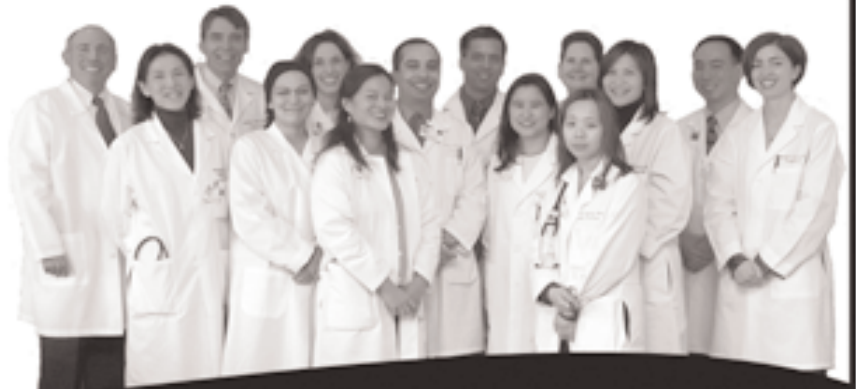
Medical Staff of the Redwood Shores Health Center

Contact us at (650) 598-3160 or visit our Web site at www.pamf.org