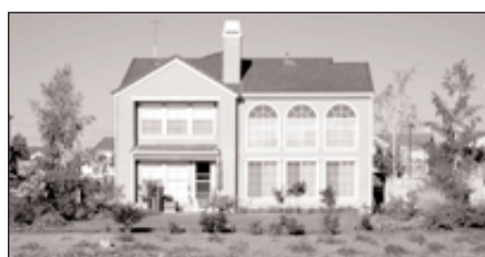
222 Biarritz Court, RWS

NEW LISTING! 2 Br +loft/2ba New carpet/paint granite counter/+fp