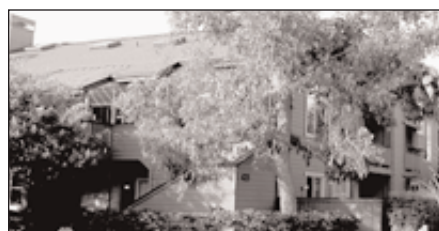
425 Cork Harbor #D RWS.

JUST SOLD! $1,380,888 4 Br +loft 3 Ba Laguna Pointe 2855 sq ft on waterways