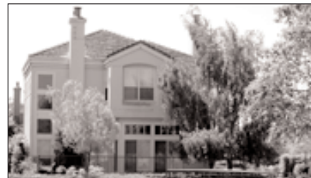
1 Manhattan Court, RWS

JUST SOLD! @ $1,412,000 5 br/3ba/2car Largest model 3200 sq ft. Immaculate