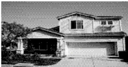
541 Jetty Way, RWS – FOR SALE 3 bd/2.5 ba, asking $975,000