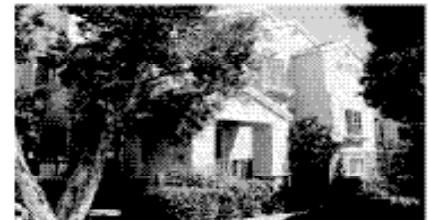
1 Batten Lane, RWS – SOLD 3 bd/2.5 ba, asking $729,000

www.RealtorKathyChang.com 中文服務 Committed to Outstanding Service