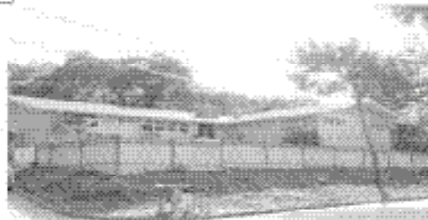
1895 Cordilleras Rd, RC – JUST SOLD 4 bd/2.5 ba, asking $1,269,000